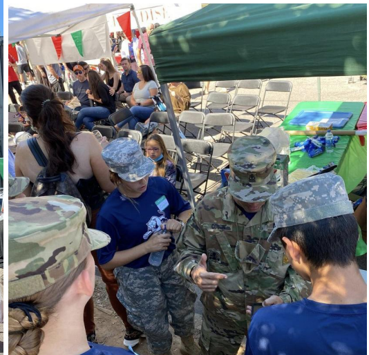
Images from Fiesta Italiana; Chief and ISGT Colon leading the way for the cadets and instructing them for helping others with great assistance.