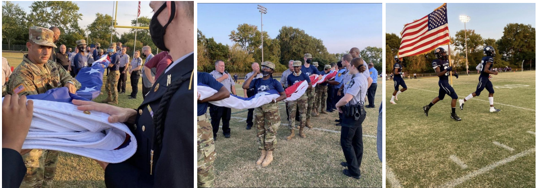
Images from the First Responders game; left and middle photo contain cadets and first responders unfolding the American flag representing our program with pride. On the far right our Battalion Commander rushing out with the American flag representing the program as well.