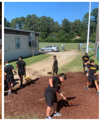
Images contain the last color guard of October (Far left), Raiders during formation before competition (middle), Cadets digging mulch for the area beautification (Far right).