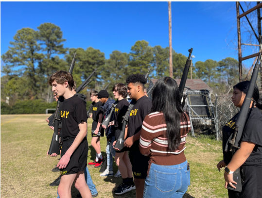
Rifle PT 1/20 Charlie cadets carrying rifles in preparation for rifle PT

In the time span of this month, Charlie Company has been through many changes, especially with most of the cadets. They have sharpened and excelled in their leadership skills, not only as cadets but also students. Part of it stood during PT as I and 1st SGT have given multiple opportunities to some of the cadets to lead when given a chance or when they have asked, in order to show their confidence and growth.