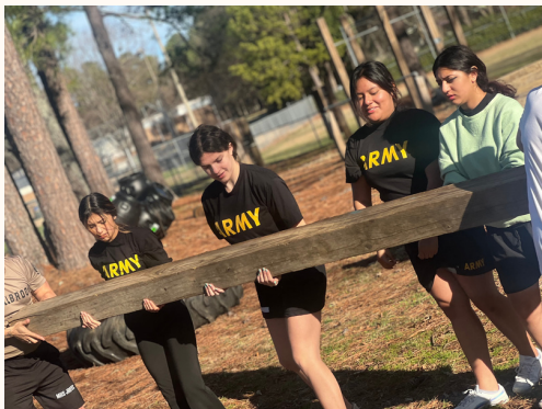
Raider area PT 1/20 Bravo cadets lifting a large wooden beam as part of the PT

As hell month commenced, Bravo started as a decent group. Throughout the month, we have gathered more knowledge about JROTC through quizzes and tests. We have also improved in drill but more specifically, in discipline. We have had many great cadets show out by putting them in unfamiliar positions. Having done this, a new platoon sergeant was assigned.