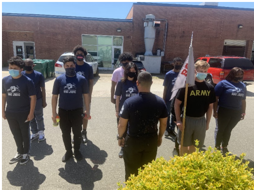
Formation coming back from PT

Squad Leaders demonstrated their abilities to lead a group in a physical event