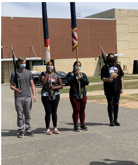
Detail for the Graduation practicing